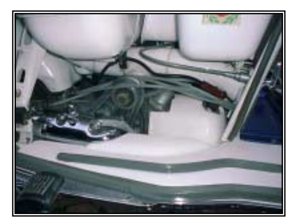
It is highly recommended that all installations use an air filter to prevent damage and premature wear from debris that can be sucked in through the induction process.